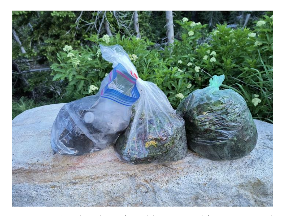
one bag of trash and two bags of Dandelions removed from Stegner's Eden

And I also just watched: the mountains, the trees, the clouds, the stars. A raven flew by just under the cliff top. At sunrise, two Chipmunks ran around instead of seven Pine Martens: less rare but equally delightful. And just as I left the place, I saw a large "vee" wake in the lake. I carried no binoculars, but I suspect a Beaver.