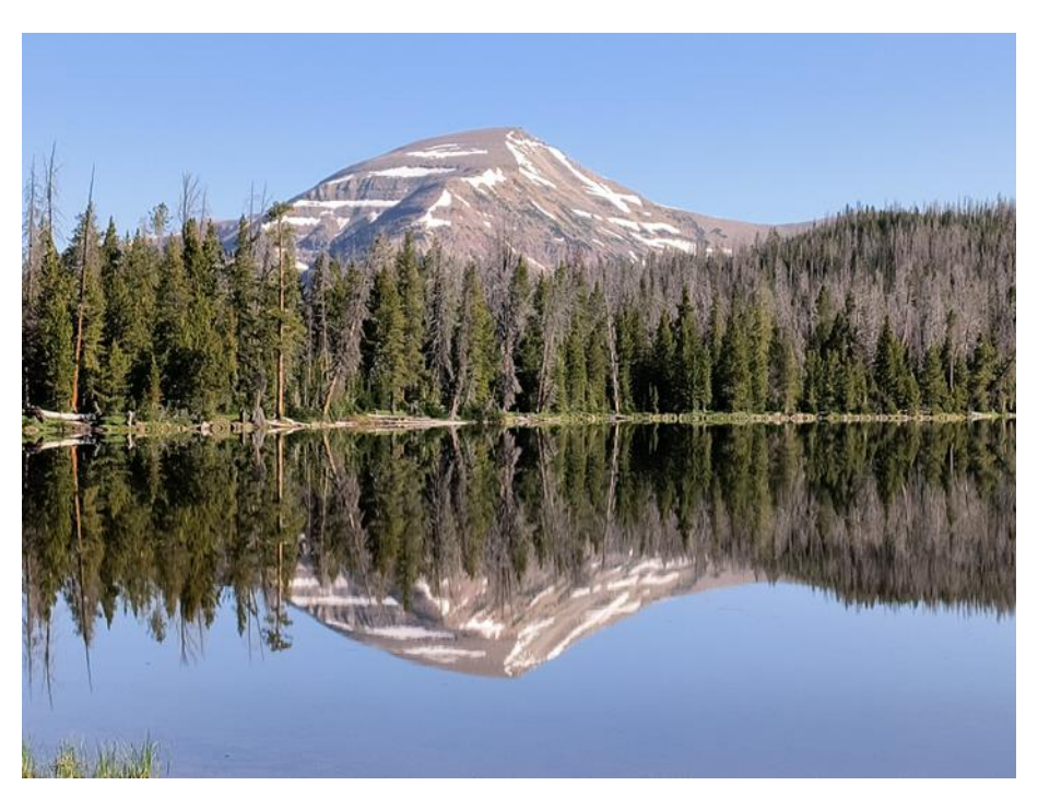
Mount Agassiz above Governor Dern Lake