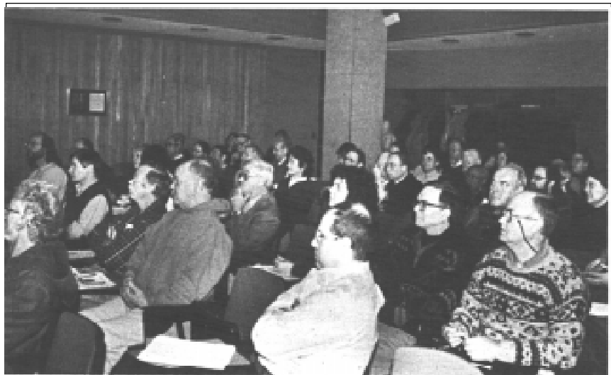
Faculty at Information Literacy Workshop

The workshop consisted of nine hour-long sessions (see outline), the first eight of which focused on core information