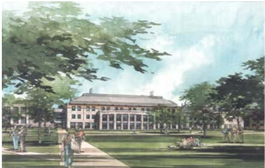
Architectural Rendering of North View of the Chemistry and Science Library Building