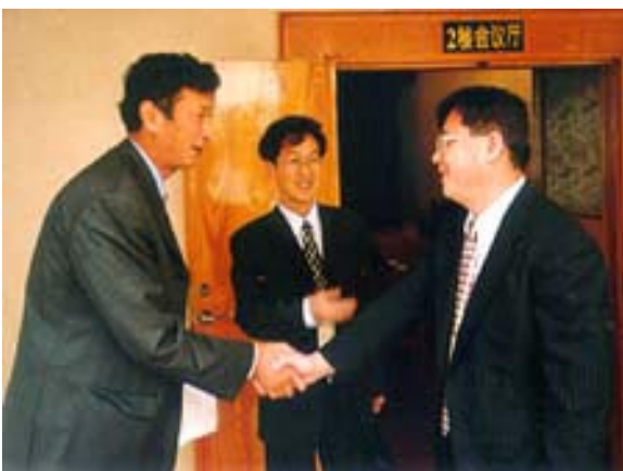
Yunnan Minister of Education Greets Haipeng Li