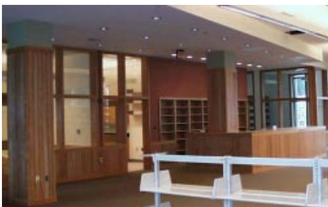
Circulation and Reference Area Nearing Completion

The increased space in the library, which provides for approximately seventeen years of collection growth, has made it possible to bring more science materials together under one roof, including the entire collection of the former Physics reading room, all