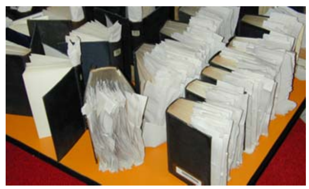
Paper Towels Being Used To Absorb Water

Ed Vermue, Special Collections and Preservation Librarian, set the Library's Disaster Plan into motion shortly after the damage was discovered. He coordinated a large team of continued on page 7