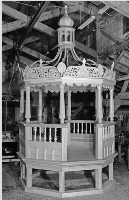
Above: A full-scale replica of the Gwozdziec synagogue's wooden bimah. Below left: Replicas of ceiling panels, 2009 winter term. Below right: Section drawing of the Gwozdziec synagogue.

The objects in the exhibition, which were created by students participating in workshops at the Massachusetts College of Art and at Oberlin, include two large-scale construction models of both synagogues and a full-scale model of the Zabludow synagogue log wall and entry door. The centerpiece of the exhibition is a full-scale replica of the Gwozdziec synagogue's wooden bimah (platform for reading the Torah) and eight half-scale replicas of painted ceiling panels from the same synagogue. The replicas of both the entry door and the bimah were hand-made using traditional materials and techniques of carving, turning, joinery, and steam bending. The exhibition