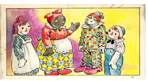
Original watercolor for Beloved Belindy continued on page 12

readily seen in the watercolors, and it is especially interesting to compare the original watercolors with printed versions in the Esther