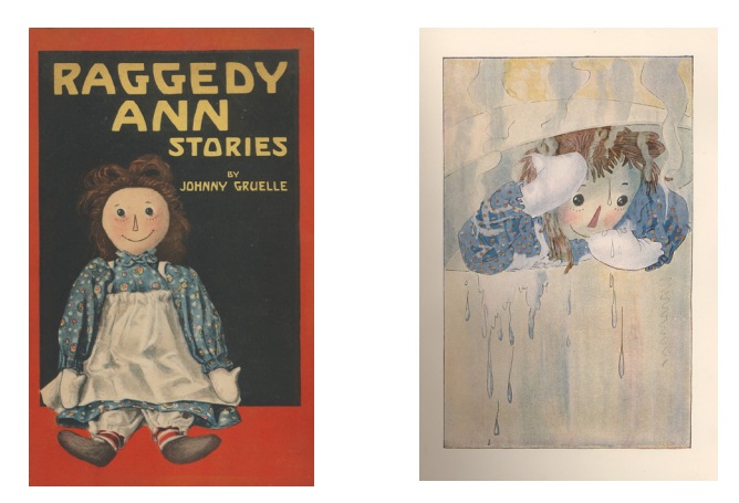
Cover of Raggedy Ann with original Gruelle watercolor

THE LIBRARY has received two fine gifts of materials related to children's literature that will be valuable for the study of book illustration and the book arts. The complementary gifts provide important support for Oberlin's developing book studies program.