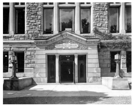
Carnegie Library entrance

The exhibition contains many photographs of the Carnegie building (interior and exterior views) and of students, faculty, and former library staff. From familiar photos of the jam-packed reading room to smaller details, such as a chart of