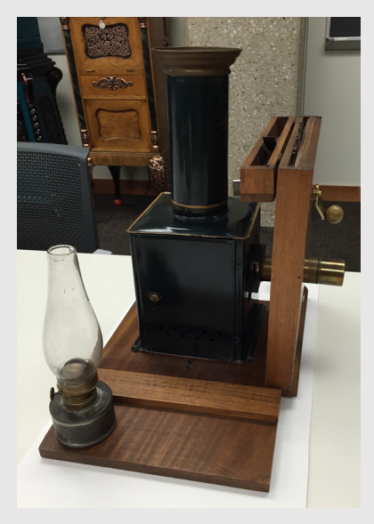
Magic lantern, late 19th century

Vermue noted that photography and cinema did not arise in a desert of visual images, but developed in an environment that already featured many ingenious ways to mass-produce and enjoy images, even moving images. Other items in special