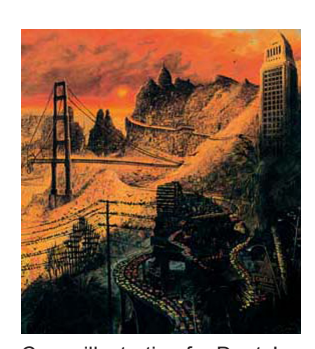
Cover illustration for Dante's Inferno

Marcus Sanders, with illustrations by Sandow Birk, are a contemporary re-envisioning of the 14th-century masterpiece that transplants the action to modern American cityscapes. The story is rife with humor, satire, and social commentary on the ills of modern urban life. The accompanying