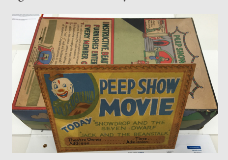
Peep box, early 1930s

century mutoscope to a child's sandand gravity-driven toy (a decorated windmill that is set in motion by sand poured through a funnel at the top). Another toy, the peep box pictured below, is a child's version of peep shows that were offered by street entertainers. The peep box created a miniature cinema, with elaborate, tiny constructions inside that one viewed through a small hole in the cover. The constructions typically depicted famous stories, fables, or current events. The earliest peep box shows were precursors to other optical toys, including the stereoscope and magic lantern. Other devices recently acquired were also very popular in the 1900s, including a kinetoscope, cail-o-scope, zograscope, polyrama panoptique, and magic lantern with slides. Together, the objects "shed light on the rich history of motion and