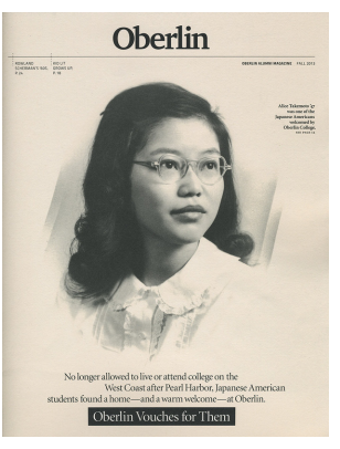
Cover of Oberlin Alumni Magazine, Fall 2013

Commons of Mudd Center last spring. Titled "Pathway to Hope and Opportunity: Oberlin as Sanctuary," the display provided an opportunity to reflect on our history of helping others during uncertain times.