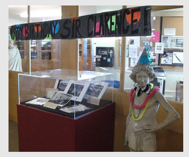
Entrance to the Art Library for the 2012 birthday party