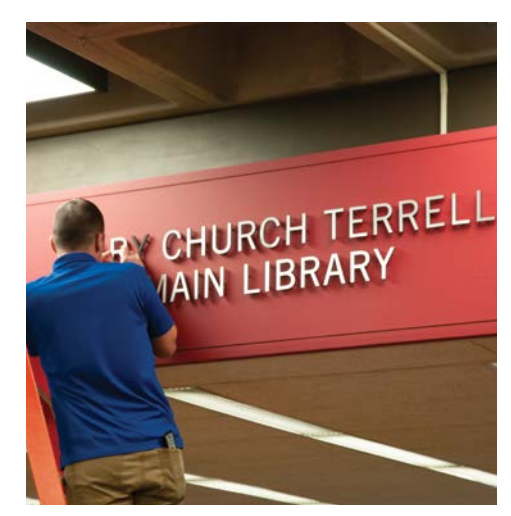
Installing the aluminum letters "Mary Church Terrell Main Library" in the Academic Commons

followed by a lively question and answer session with the audience.