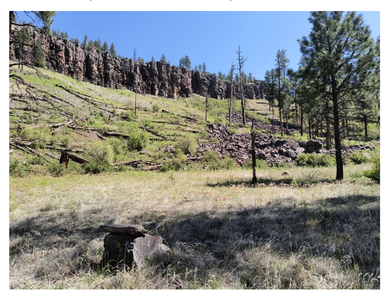
My best candidate for the kill site at latitude/longitude 33.7281, -109.3605.

I walked down to the Black River, picked up the Black River Mainstream Trail, and followed it downriver. Here's a photo of the riverside site where Leopold killed the Green Fire Wolf: