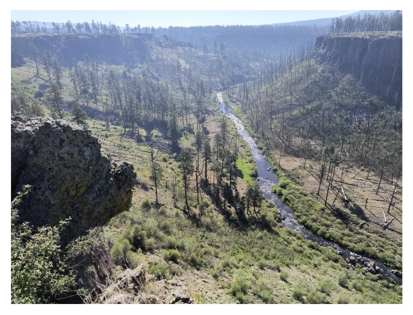
My best candidate for the lunch and shooting site at latitude/longitude 33.7286, -109.3626.

After more walking upstream, rejecting one or two other candidates, I found a place that cured all these defects.